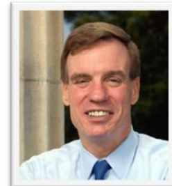
Sen. Mark Warner U.S. Senator from the Commonwealth of Virginia